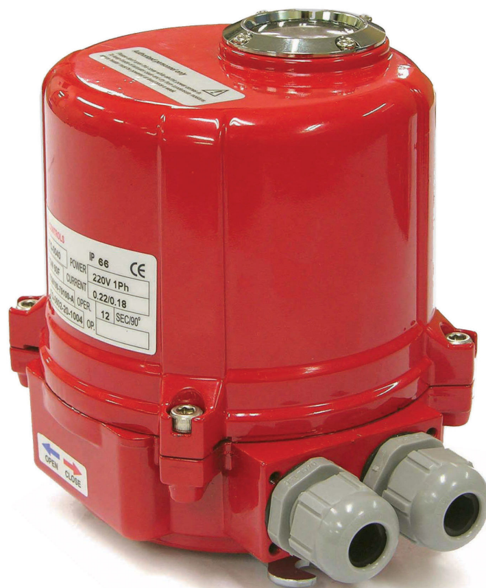
ITQ-0040 Doc No: ITQ-M0101/0040

I-Tork Building, 74-6, Chun Ui-Dong, Won Mi-Gu, Bucheon, Kyoung Ki-Do, Korea